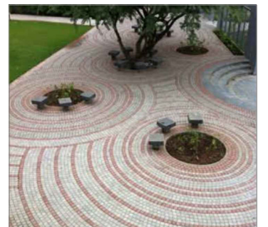
PAVING PATTERN-COBBLE STONE