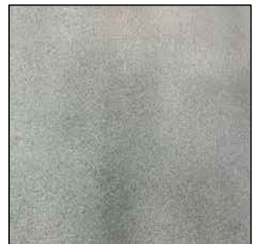
BRUSH FINISH KOTA FOR FLOORING