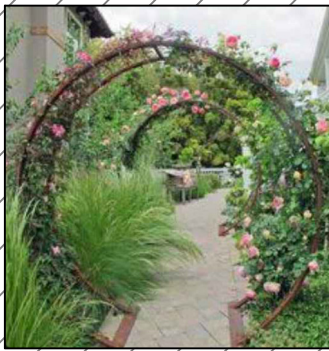
OPTIONS FOR ENTRANCE ARCH