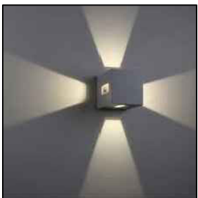
FOUR WAY LIGHT ON WALL