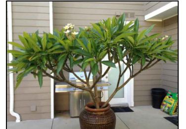
PLUMERIA ALBA IN POT