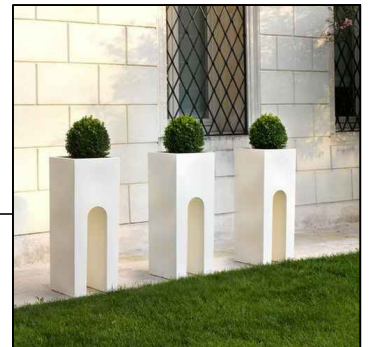
FRP POT NEAR FOOD COUNTER