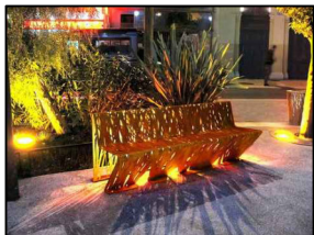
READY MADE BENCH OPTIONS