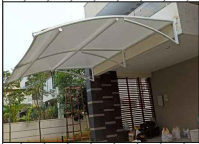
TENSILE FABRIC CANOPY ABOVE BENCHES