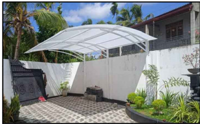
FRP SHEET CANOPY ABOVE BENCHES