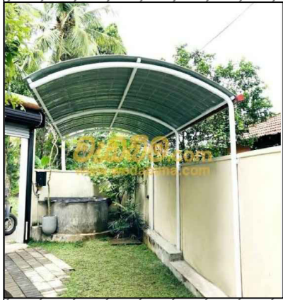
MS CANOPY ABOVE BENCHES