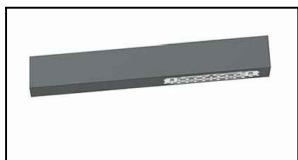
BRACKET LIGHT ON WALL